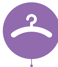
FASHION GROOMING & BEAUTY

The top three audiences in this campaign were: