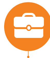
BUSINESS DECISION MAKER